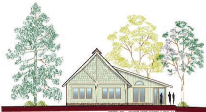
Cabin 5 Front Elevation