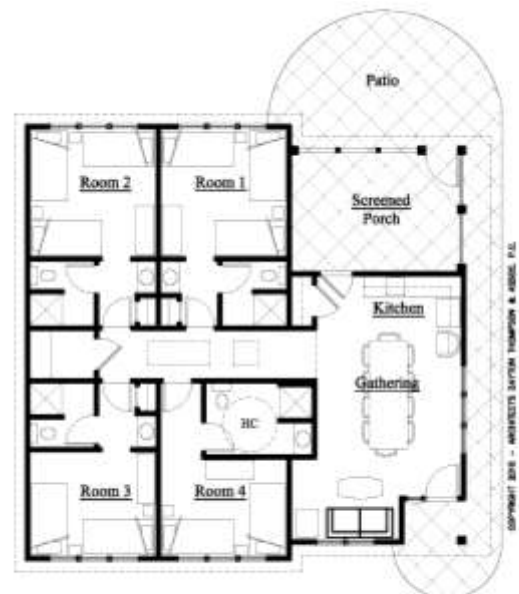
Cabin 5 Floor Plan 1,380 SF